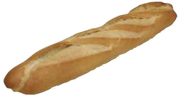
ref. 2038 Pistola