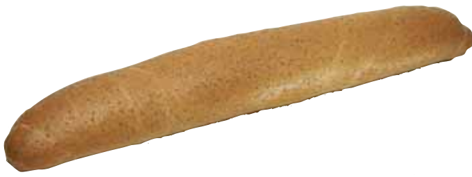
ref. 2031 Integral grande