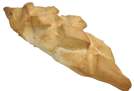
ref. 2017 Colón Pequeño