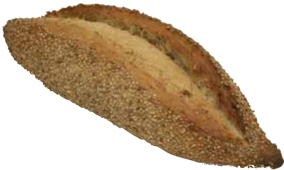
ref. 2029 Pan de Semilla