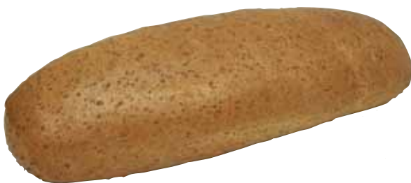
ref. 2032 Integral Pequeño