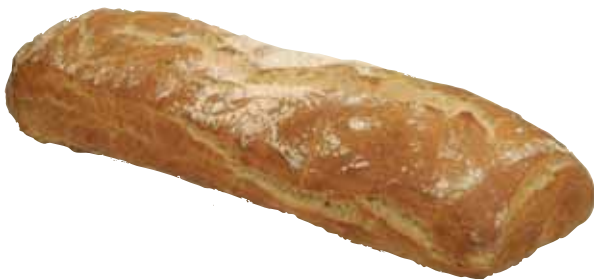
ref. 2011 Chapata Grande