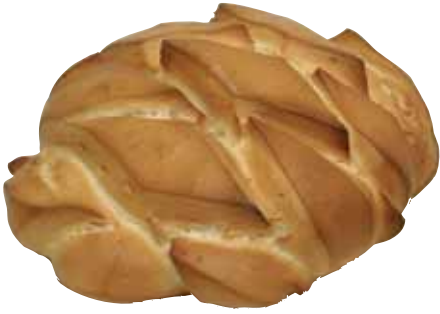
ref. 2025 Pan Candeal