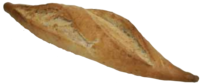
ref. 2047 Pan Alemán