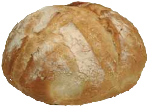
ref. 2035 Payés