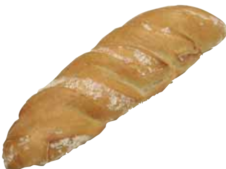
ref. 2026 Pan de Fibras