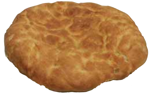
ref. 2063 Torta de Aranda