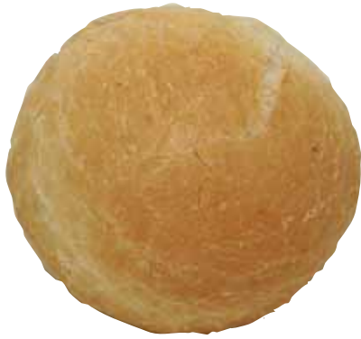
ref. 2006 Bolita de Pan