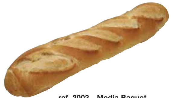
ref. 2003 Media Baguet