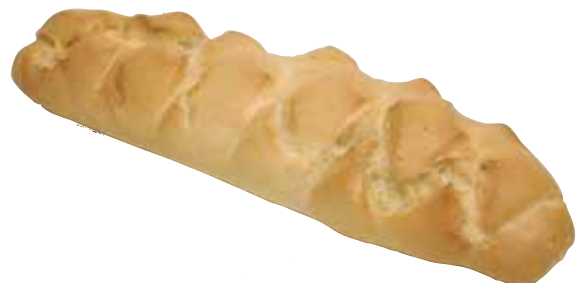
ref. 2037 Sin Sal