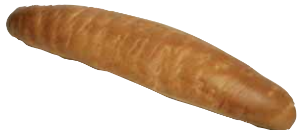
ref. 2030 Pan de Torrijas