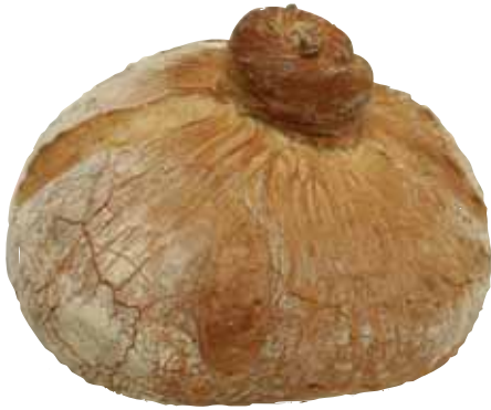
ref. 2019 Gallega