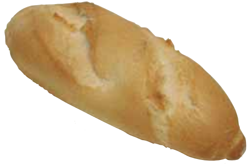
ref. 2046 Viena