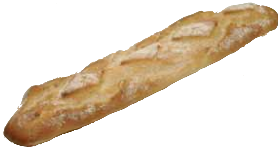
ref. 2027 Pan de Leña o Molinera Castellana