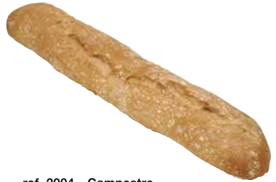
ref. 2004 Campestre