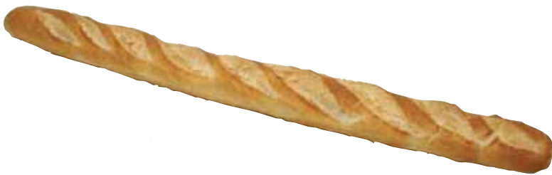
ref. 2002 Baguet Mediana