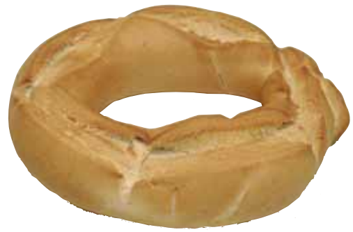
ref. 2045 Rosca